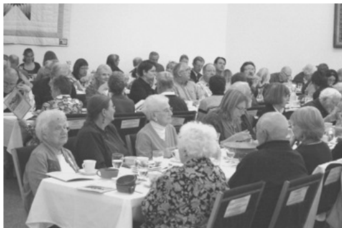
Empty Bowls 2010