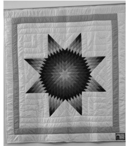
Star Quilt Given to BUCC by Charles Woodard