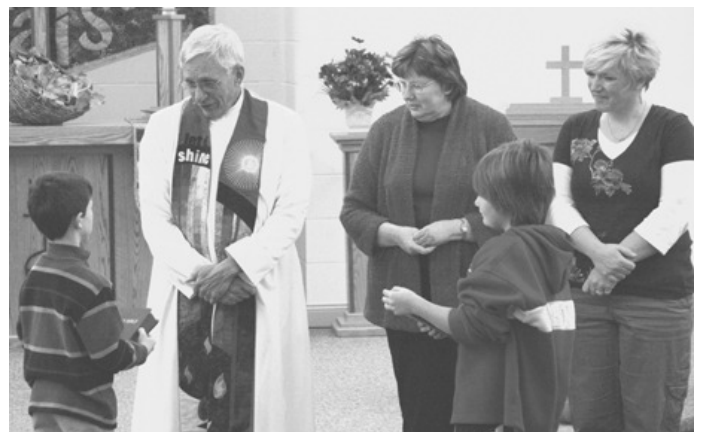
3rd Graders Receive a Bible