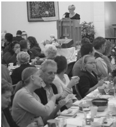
Empty Bowls 2010