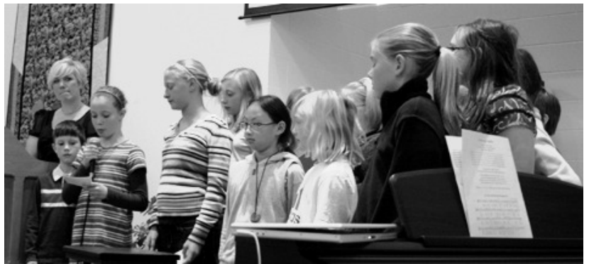
The Children at Empty Bowls 2010