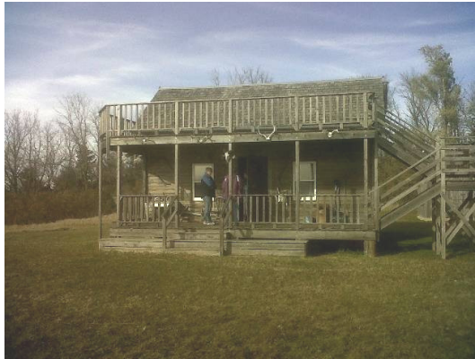
Harmony Hill Bison Farm